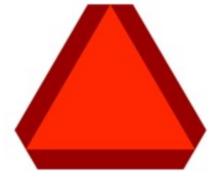
Slow Moving Vehicle

MFBF Women's Committee's mission is to help Massachusetts Farm Bureau promote a positive image of agriculture through education.